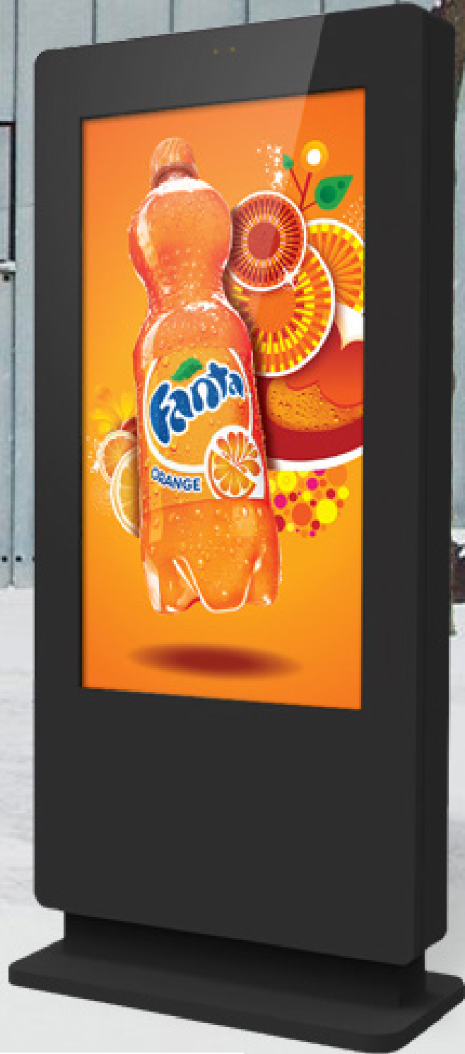
55" Outdoor Freestanding Digital Posters