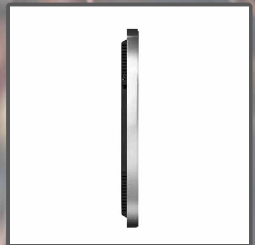
55" Slimline Digital Advertising Display