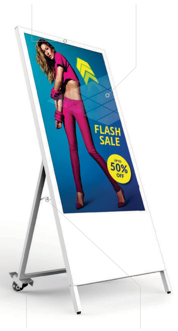
FIXED LOCKABLE CASTORS