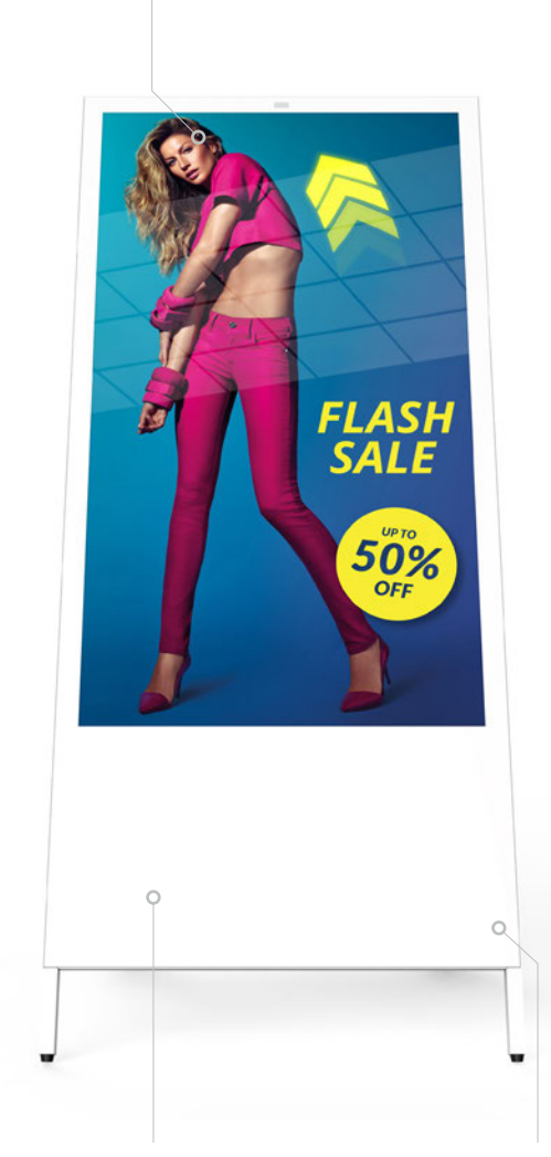
PLUG AND PLAY