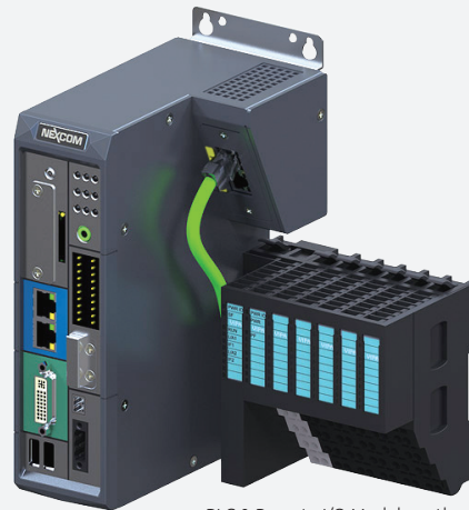
PLC & Remote I/O Module as the option FBI Fieldbus Module Kit as the option