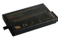
Main Battery / Low Temperature Battery (7800mAh) Lightweight Battery (5200mAh)