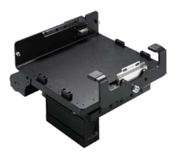
Vehicle Dock W x D x H: 348 x 310 x 215mm (13.70" x 12.20" x 8.46")