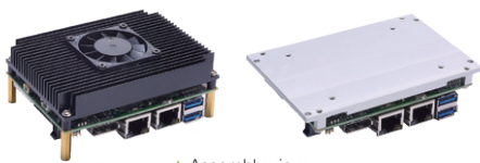
▲ Assembly view