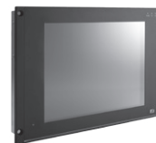
▲ Touch without keypad version