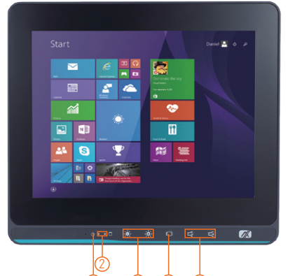
Power LED HDD LED Brightness adjust +/ Display on/off Volume on/off