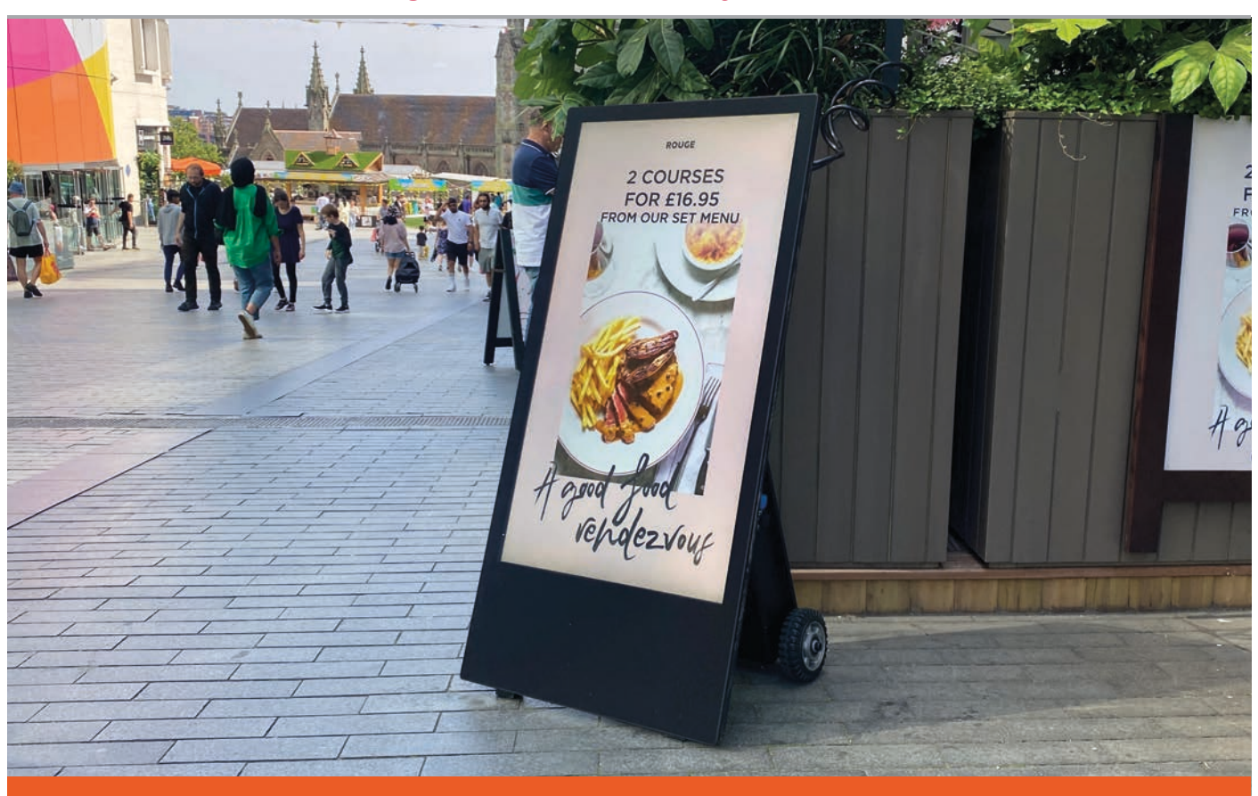
Fully portable solution for any space; display content all day and night on a single charge