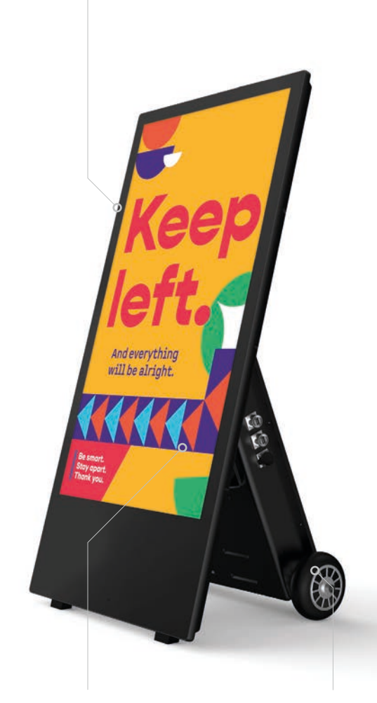
ULTRA RESISTANT TO BLACKENING DEFECT