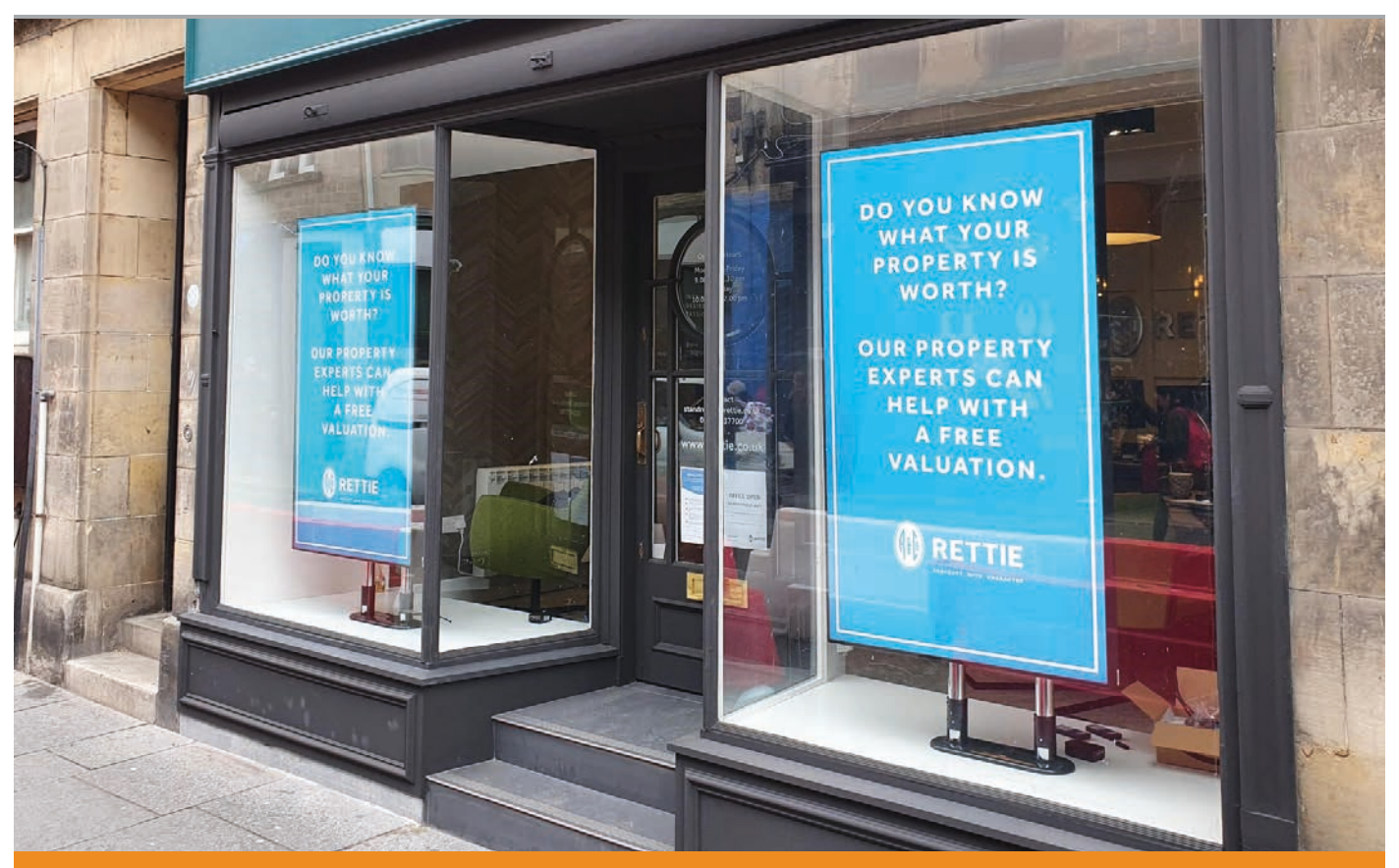
Designed for outward-facing window displays in direct sunlight