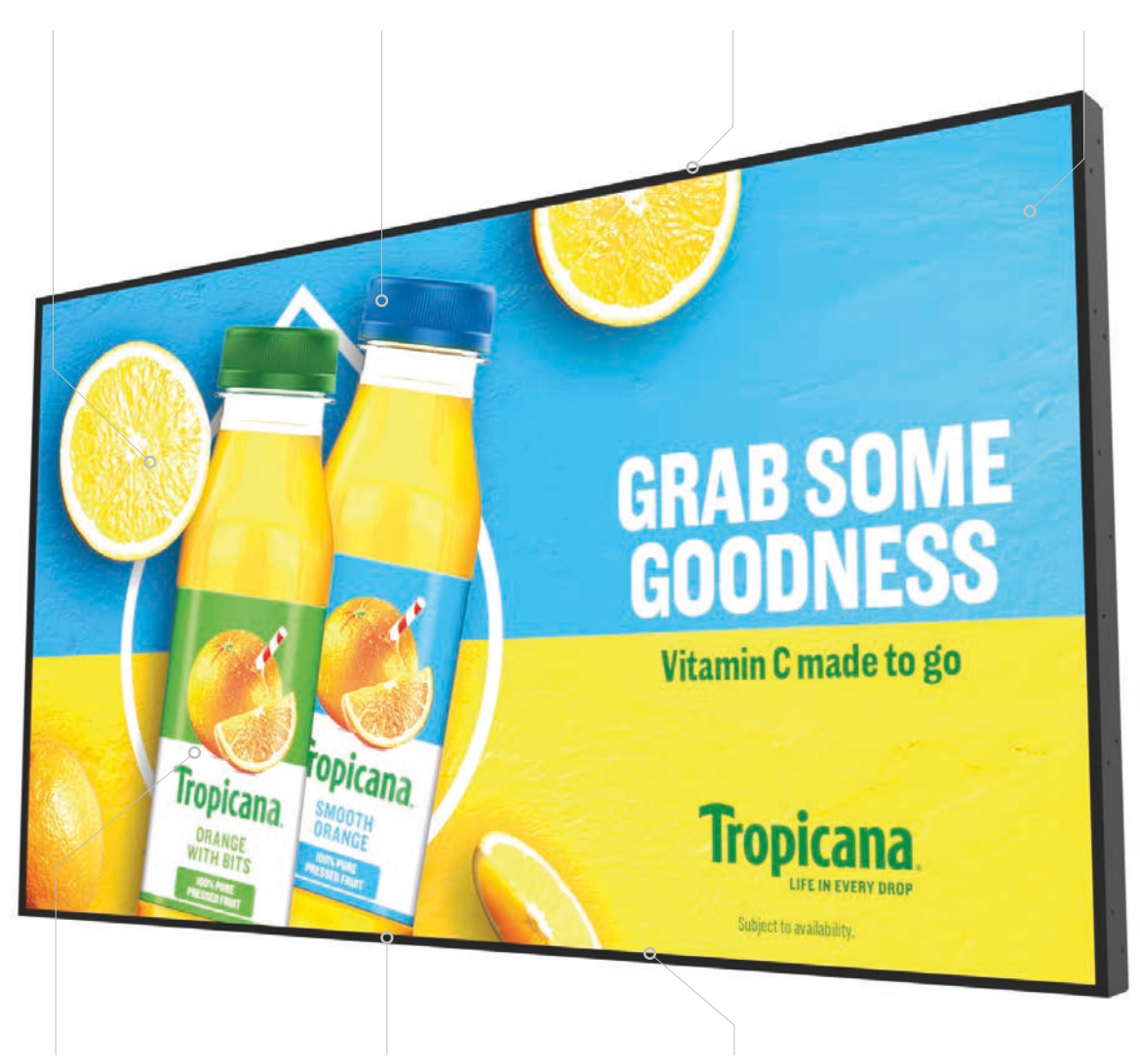
SUPER HIGH CONTRAST RATIO