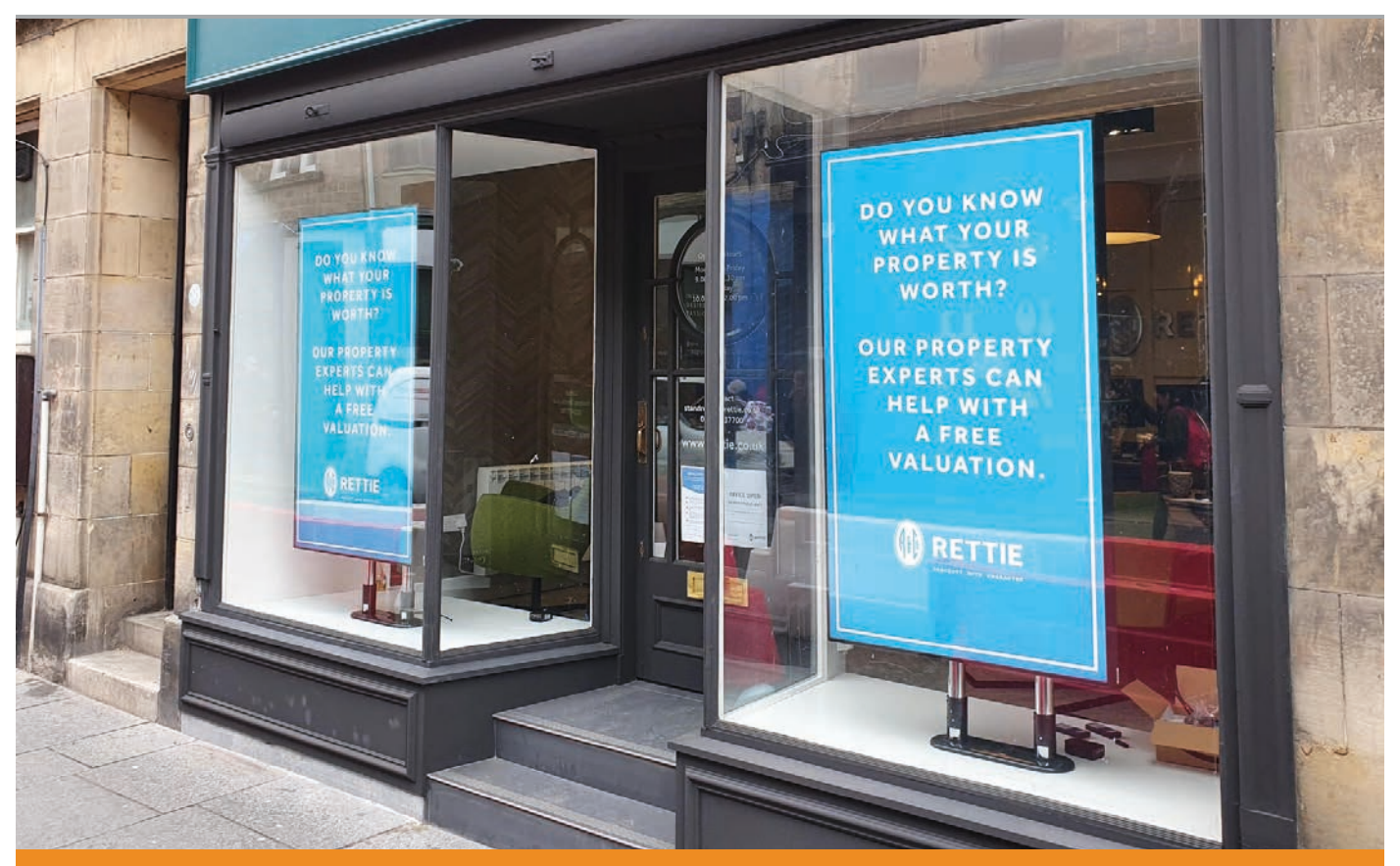
Designed for outward-facing window displays in direct sunlight