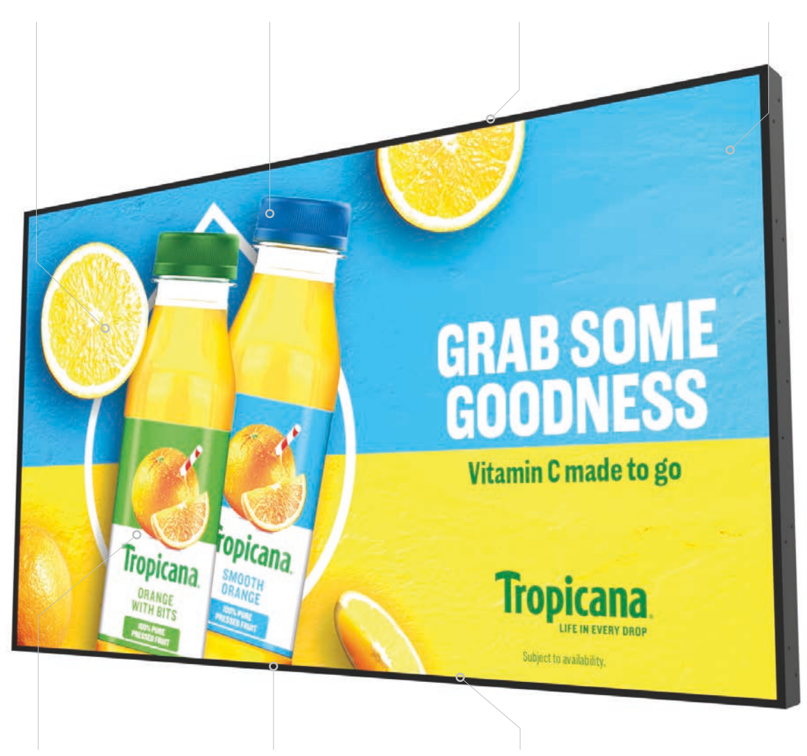
24/7 IPS PANEL