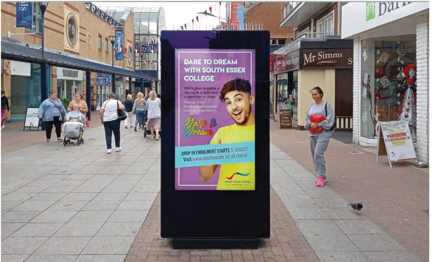
Stunning outdoor totems; perfect for any weather conditions