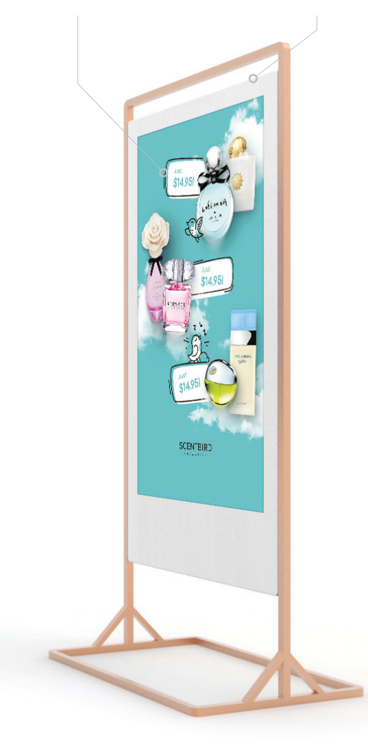
WIDE VIEWING ANGLE