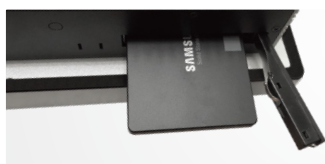
Lockable HDD Tray