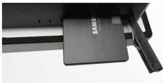
Lockable HDD Tray