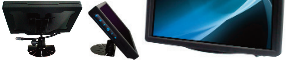
- IPS XGA Version XF1000T -

The XF1000 is available with VGA and Audio input as standard, optional DVI, Composite Video and S-Video inputs. All inputs are available as factory option on the rear panel. Optionally it includes "all in one cable", with a lockable connector for an easy and quick installation.