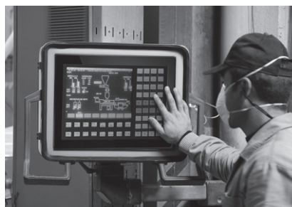
▲ Ideal for factory automation & self-service kiosk in retail