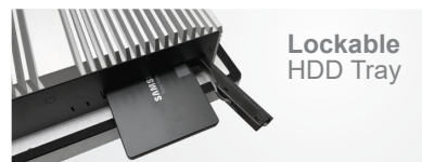
Lockable HDD Tray