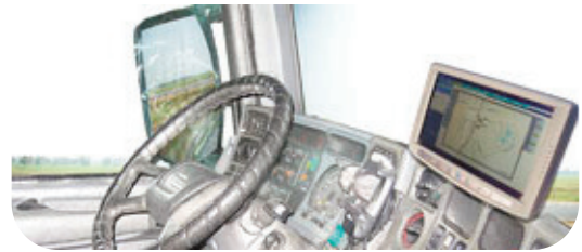
-XF700HB-US Under Sunlight -

In addition, the XF700 includes the latest generation of LED backlight with passive enhancement, to achieve a high brightness keeping the lowest power consumption. Besides, the manual and automatic dimmer bring the possibility of match the brightness to the ambient light, it makes the display able to work from darkest conditions without disturb the driver's visibility, upto high brightness for the strongest light environments.