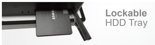
Lockable HDD Tray