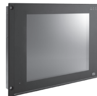
▲ Touch without keypad version