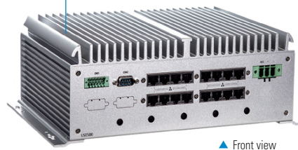
▲ Front view