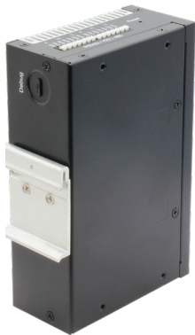
DIN-Rail Mount Illustration