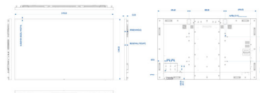
Philips 98BDL4150D Model 98BDL4150D