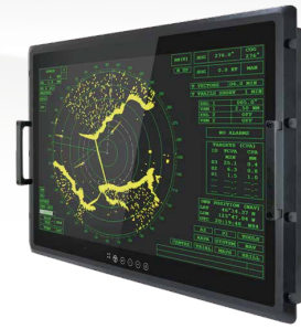
Option 2 With Projected Capacitive Multi Touch