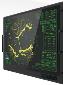
Option 1 With AR Protection Glass, No Touch function