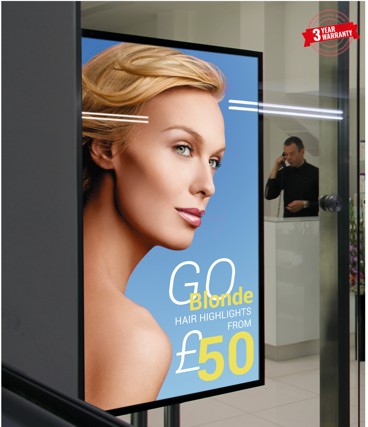
32" High Brightness Monitor