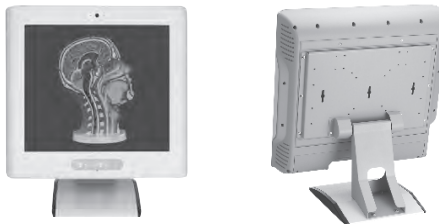
▲ Stand kit