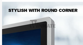
STYLISH WITH ROUND CORNER