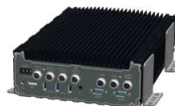
▲ SEMIL wall-mounted