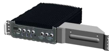
▲ SEMIL 19" rack-mounted