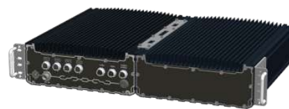
▲ SEMIL 19" rack-monuted