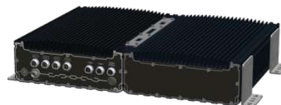
▲ SEMIL wall-mounted