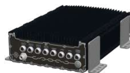
▲ Single SEMIL wall-mounted