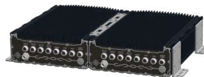
▲ Dual SEMIL wall-mounted