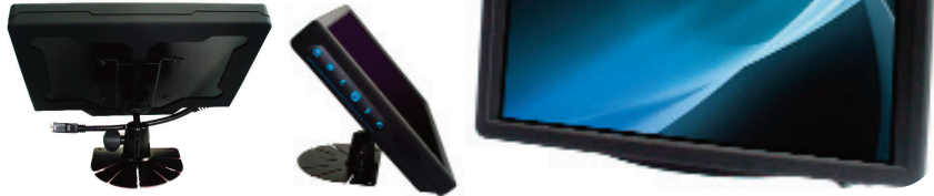
- IPS XGA Version XF1000T -

The XF1000 is available with VGA and Audio input as standard, optional DVI, Composite Video and S-Video inputs. All inputs are available as factory option on the rear panel. Optionally it includes "all in one cable", with a lockable connector for an easy and quick installation.