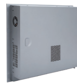
▲ Less screw design