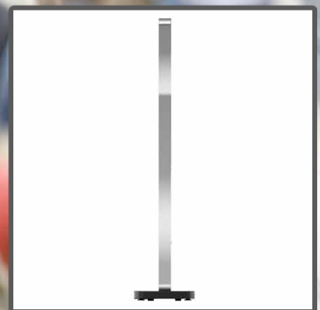
55" Slimline Freestanding Digital Poster