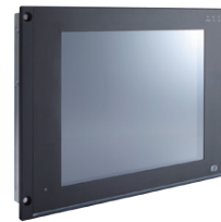
▲ Touch without keypad version

Windows® 7 Windows® 8/8.1 Windows® 10 Windows® 10 IoT