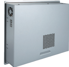
▲ Back view