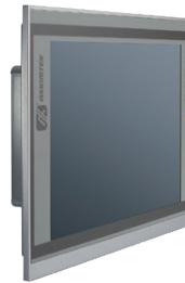
▲ Ultra-slim mechanism design