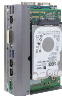
▲ POC-300 with MeziO™ - R11 and 2.5" HDD

** For sub-zero operating temperature, a wide temperature HDD drive or Solid State Disk (SSD) is required.