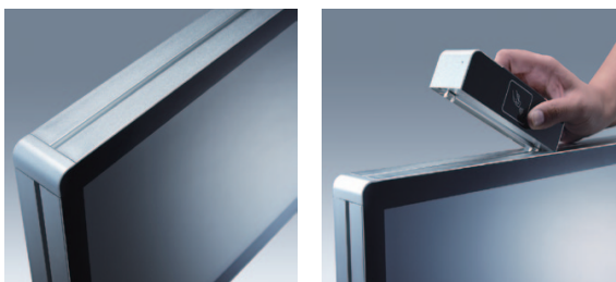
Side groove design for Flexible peripheral device